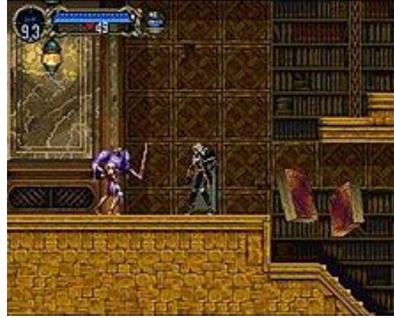
Castlevania: Symphony of the Night (PSX)